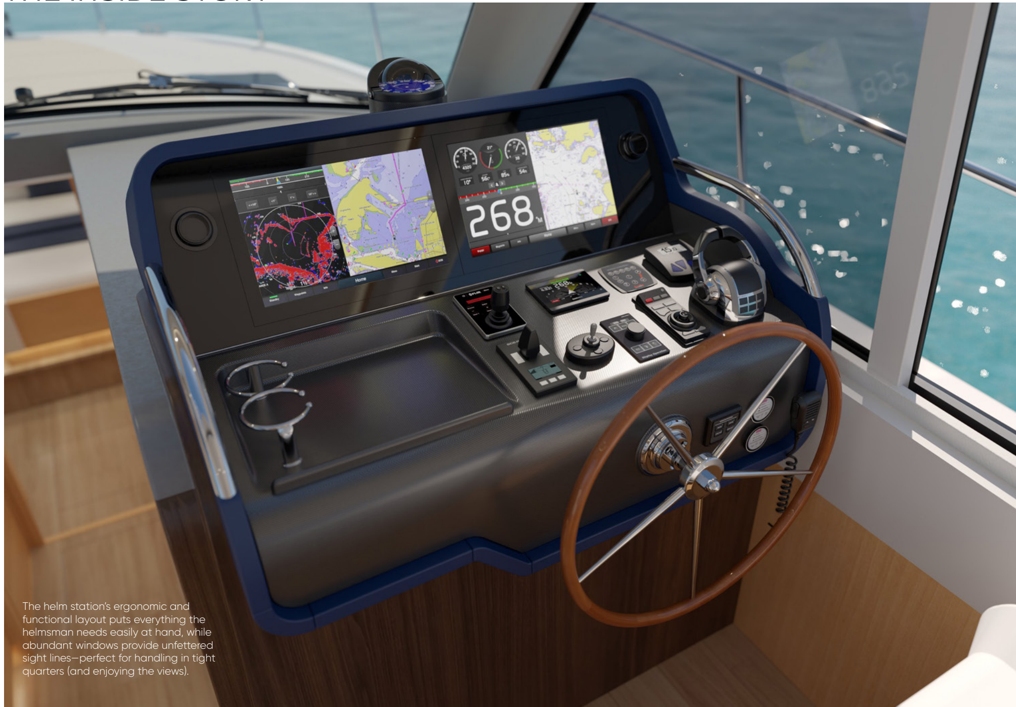
The helm station's ergonomic and functional layout puts everything the helmsman needs easily at hand, while abundant windows provide unfettered sight lines—perfect for handling in tight quarters (and enjoying the views).