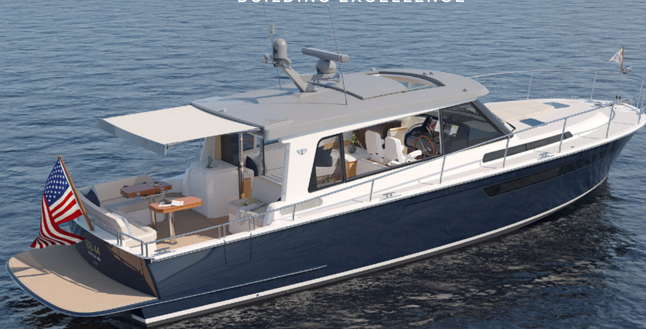
Boston Boatworks 44 Offshore Express Cruiser