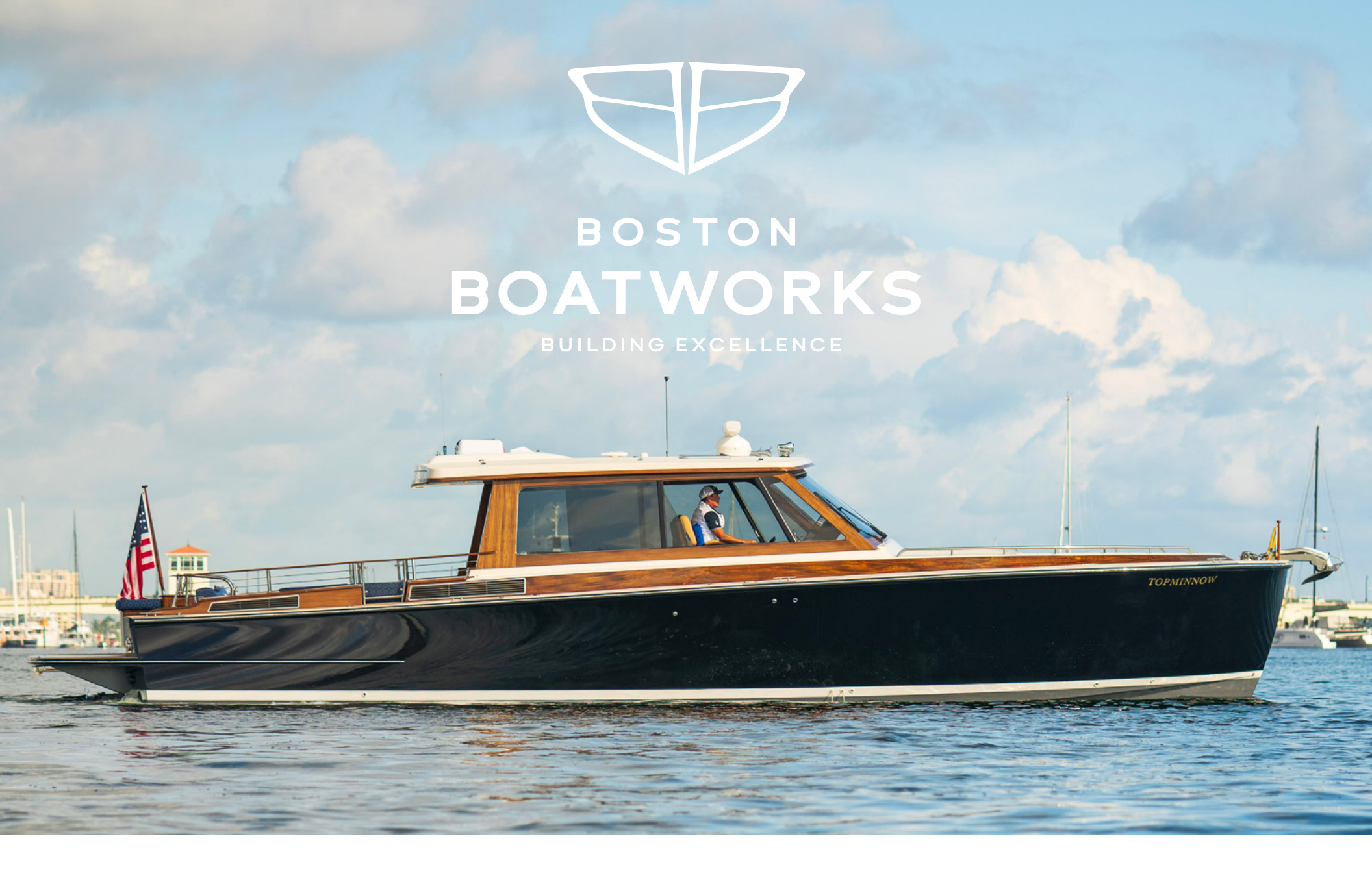
Boston Boatworks Daychaser 48